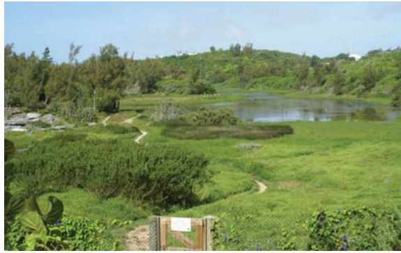
Spittal Pond Bird Sanctuary

Every member makes the Trust's voice stronger!