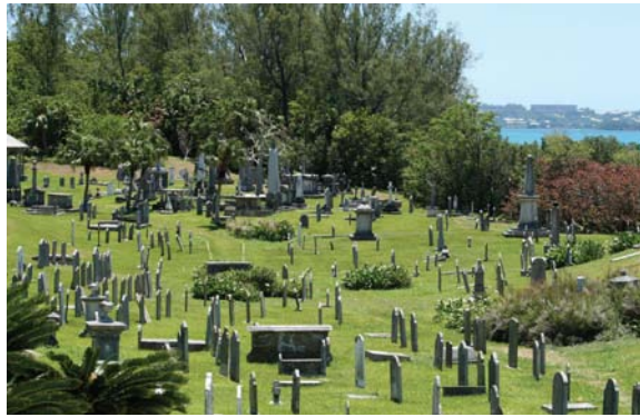
Royal Naval Cemetery