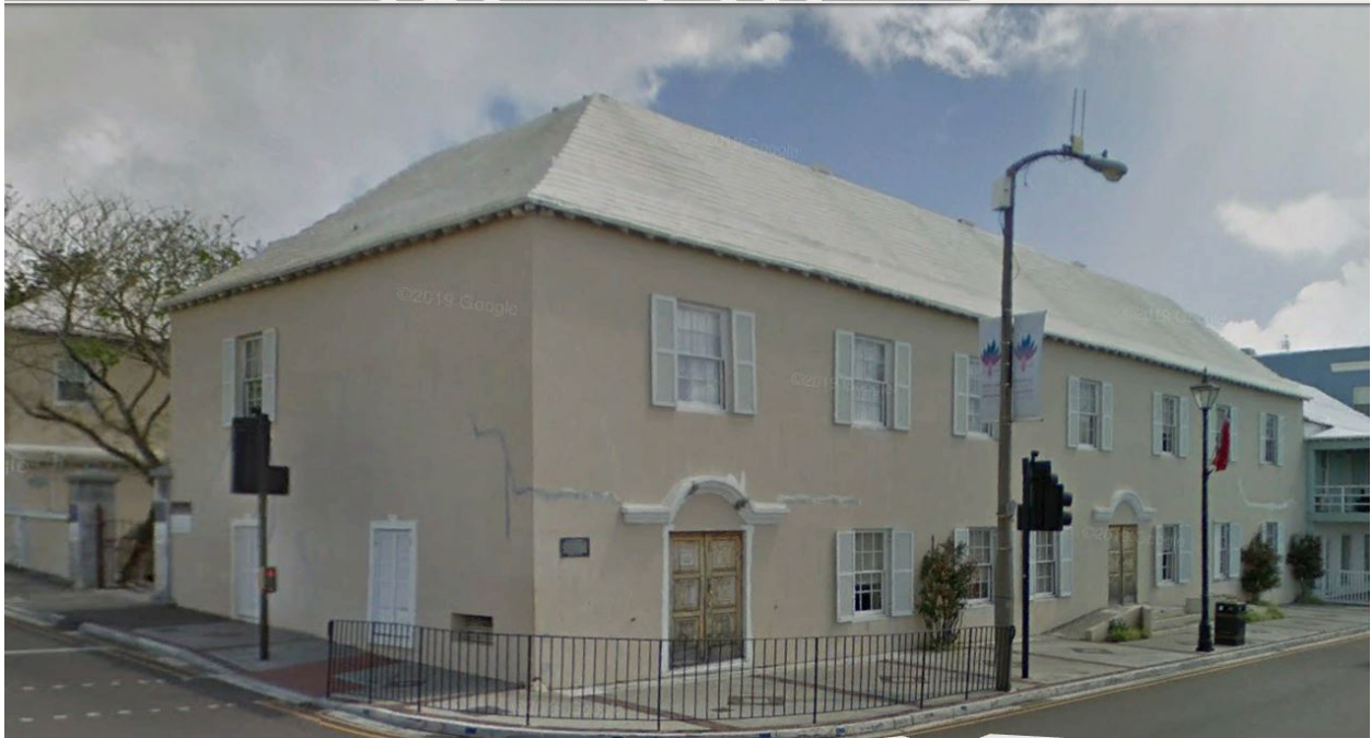
The Supreme Court Registry in 2021