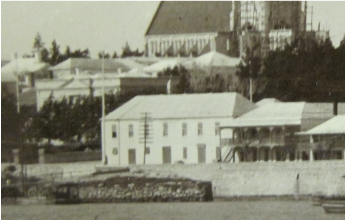
The Customs House Warehouse and Town Hall Building in early 1905