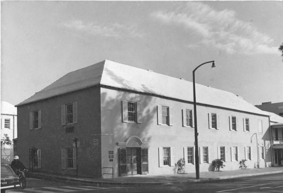
The Old Town Hall became the offices for the Department of Tourism in 1972

The Old Town Hall remains closed. This is disturbing since it was given a Grade 2 listing in 2013 when the Bermuda Government and the Corporation of Hamilton agreed to list their city properties. The other buildings listed were Sessions House, Cabinet Office, Old Magistrates Court, City Hall, Perot's Post Office, Par-la-Ville and Victoria Park Bandstand. Until then the Anglican Cathedral was the only listed building in Hamilton.