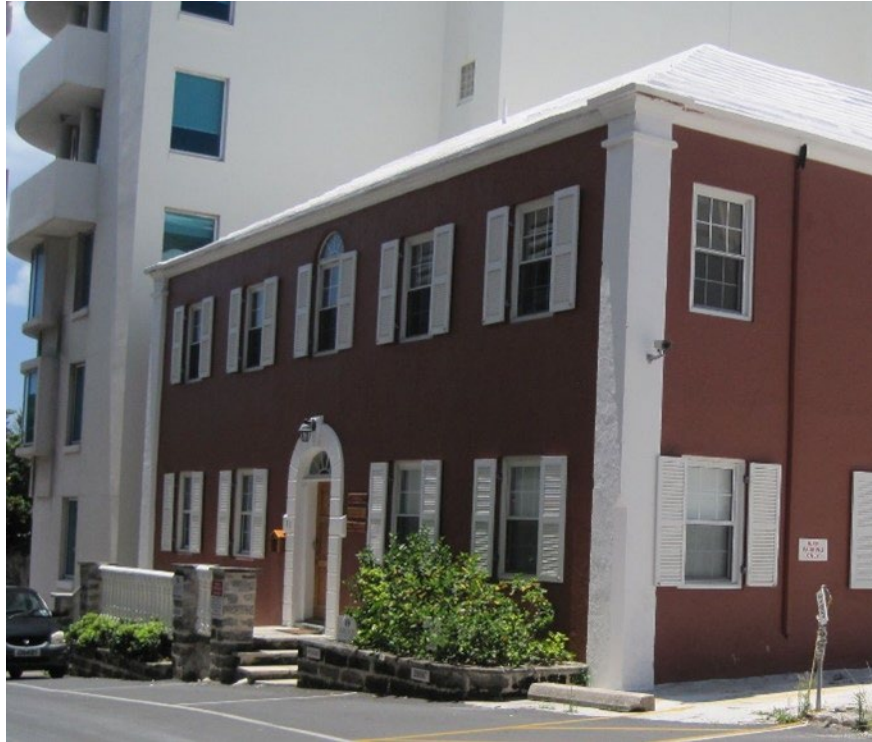
Hurstholme in 2013.