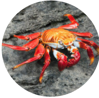
Sally Lightfoot Grapsus grapsus NATIVE

The beaded periwinkle climbs up to 14 feet a day to escape the intertidal waters. It feeds off algae on the rocks.