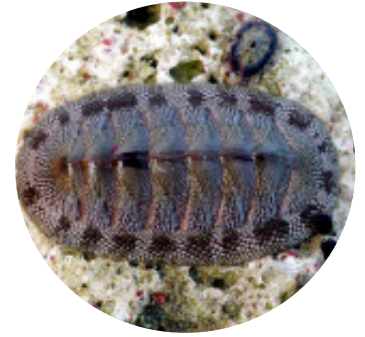
West Indian Chiton NATIVE Chiton tuberculatus

Bermuda Skinks eat insects, dead fish, and broken seabird eggs. Many get trapped in bottles and cannot get out, which is why they are now so rare.