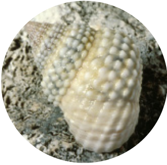
Beaded Periwinkle Tectarius muricatus NATIVE

Along our rocky coast when the tide is low, you will find rock pools bursting with life! Each rock pool is its own little eco-system.