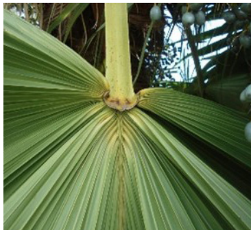
CHINESE FAN PALM