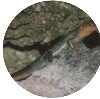
Bermuda Skink ENDEMIC Pleistodon longirostris

The Sally Lightfoot is the only known crab that can jump. It does this to avoid being caught as prey.