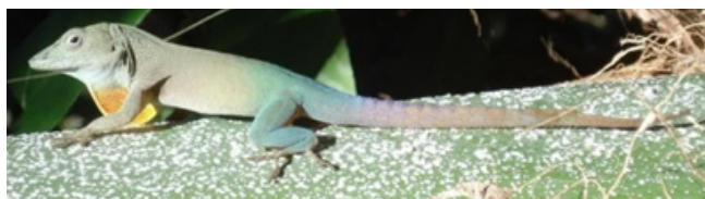
Jamaican Anole (Male)