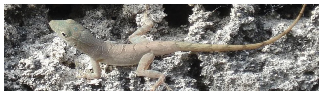
Jamaican Anole (Female)