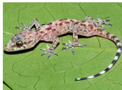
Mediterranean or Turkish Gecko