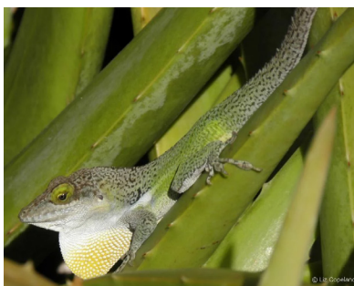
Antigua Anole (Male)